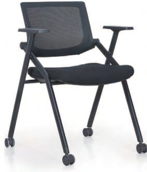
Folding meeting chair, with armrests and castors