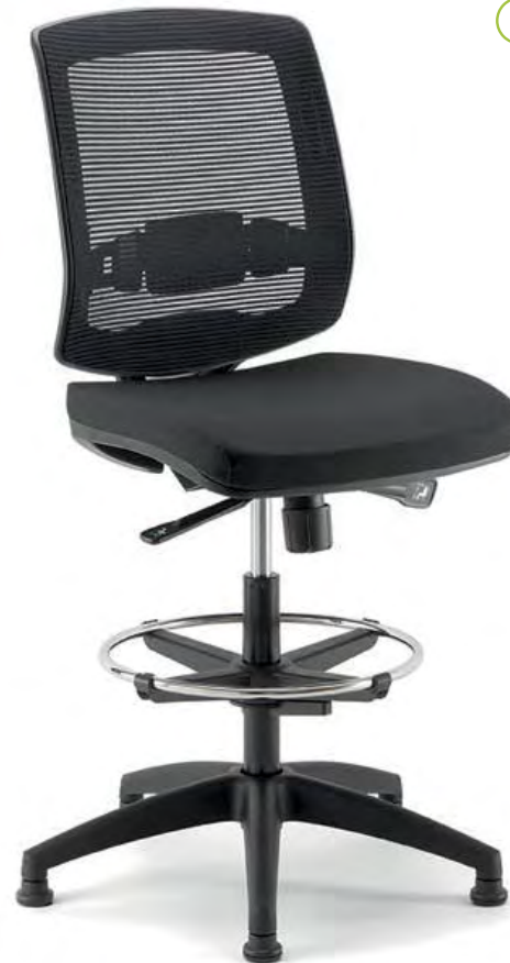
High operator chair