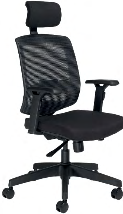
Operator chair with headrest and armrests