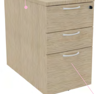
Desk high pedestal