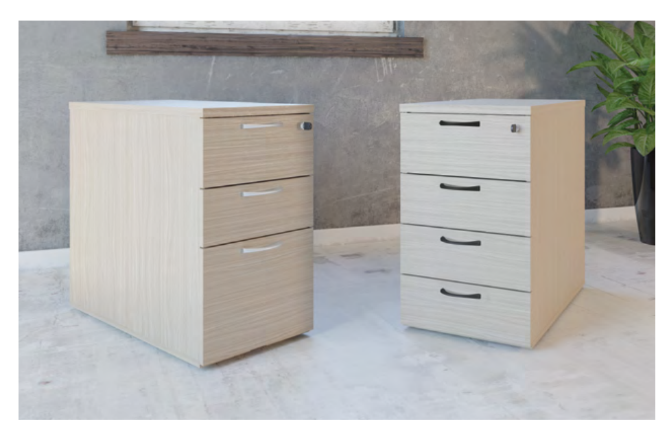
D 80 cm desk high pedestals 3 drawers including 1 Lateral filing drawer and 4 box drawers \, Bleached Oak