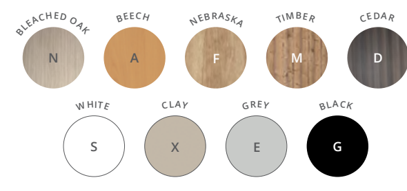
Pedestals, tops and Top box MFC finishes